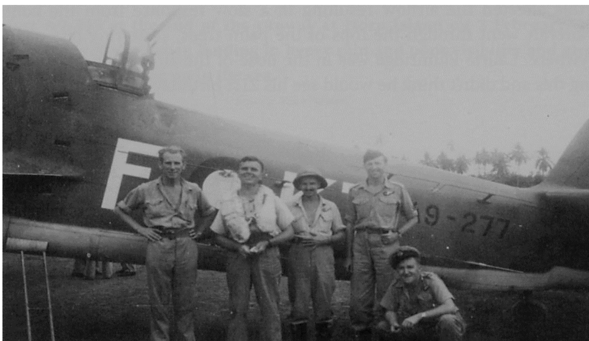
A9-277/KT-F and friends.