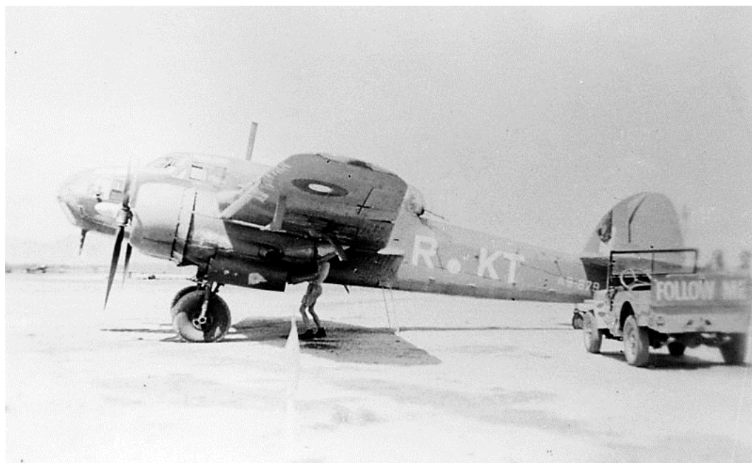
A9-679/KT-R prior to returning to Australia. Judging by the undersides of the wing, the aircraft seems to be in overall Foliage Green. [adf-serials.com.au].

On October 22 nd , 1945, it was received by 15ARD with the intention of sending the aircraft off for further service with 8SQN. That was cancelled and it was then decided to send it to 100SQN but that, in turn, was also cancelled and the aircraft, instead, was sent to 7AD for storage, being recorded as received there on January 22 nd , 1946. 234