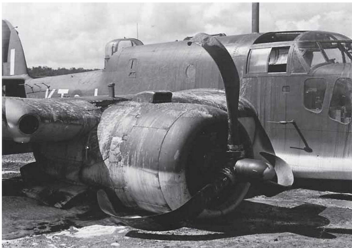
A9-294/KT-J at HIGGINS after its undercarriage collapse. [Gordon Birkett].

On June 10 th , 1944, A9-294 suffered a landing accident at HIGGINS when the undercarriage collapsed. On the 14 th , it was received by 1RSU for repairs but it was then decided that the aircraft would be broken up for spares. 112