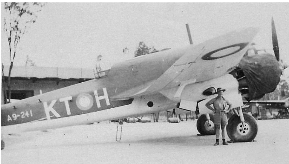
A9-241/KT-H at 12RSU. [Gordon Birkett].

A9-241 was returned to 7SQN from 12RSU on September 17 th , 1943. 97