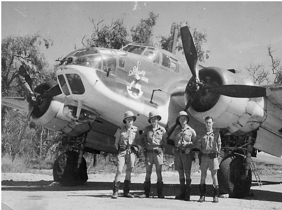
A9-123/KT-Q, "Slippery SAM".