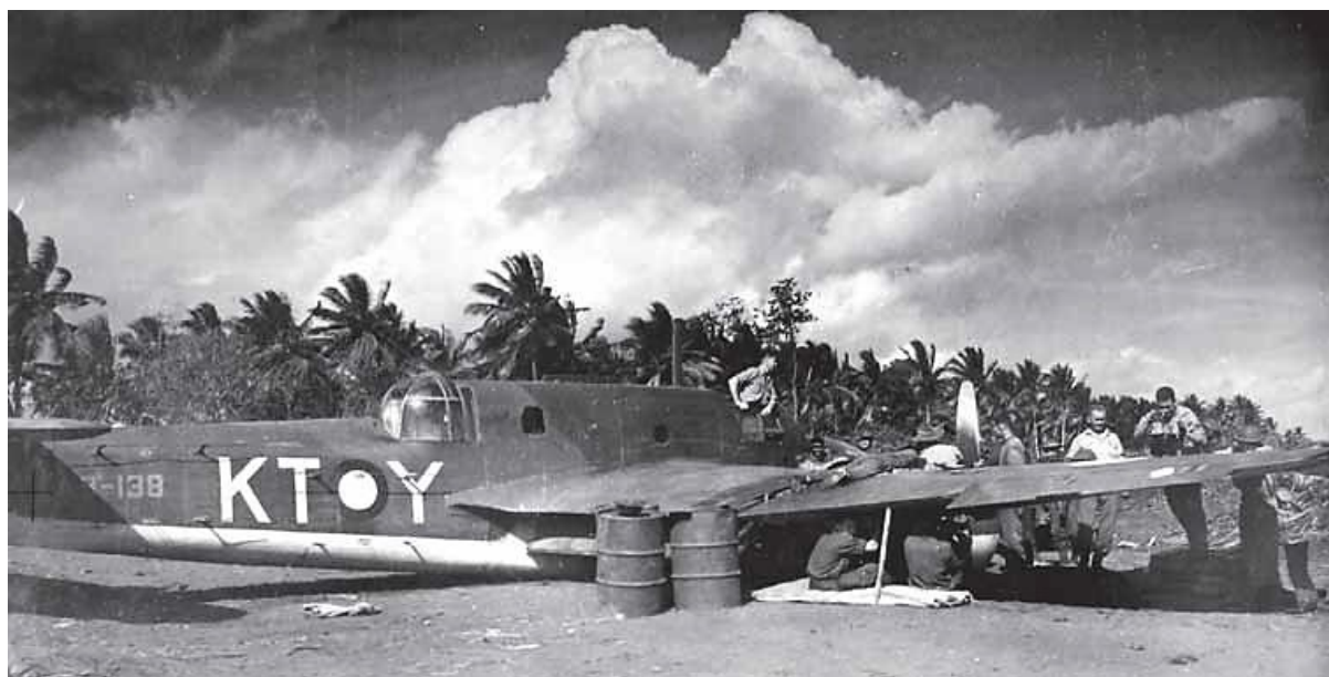
A9-138 on the ground at AUGUSTA. [Gordon Birkett].

According to the July 2 nd E/E.88 entry, the aircraft suffered an engine failure (forced landed at AUGUSTA) which resulted in damage to the undercarriage, engine(s), props and wings. It was allotted to 1RSU for repairs and, on August 30 th , was “[s]hipped ex Thursday Island in the JAMES HOGG ” (but see footnote, below) 43 off to 3AD (its destination being amended to DAP, Melbourne). 44