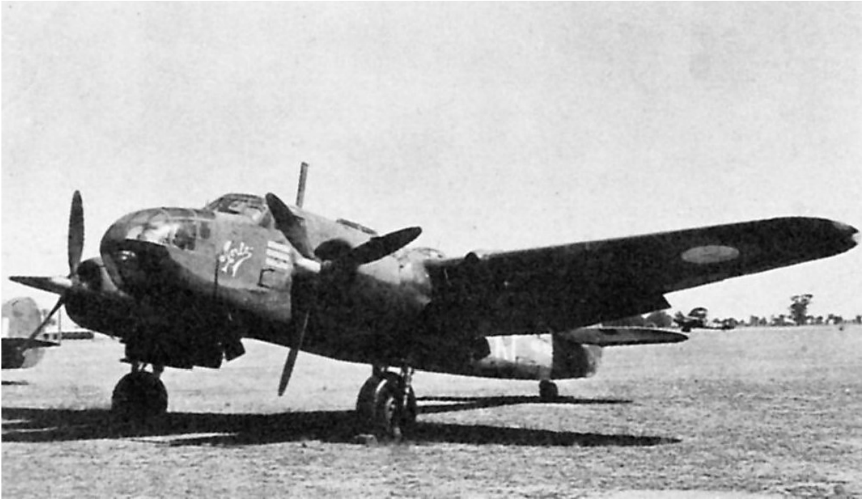
A9-502/KT-C at, presumably, TOCUMWAL, NSW. Aircraft seems to be wearing the original style RAAF Foliage Green and RAAF Earth Brown disruptive pattern camouflage, but the former RAAF Sky Blue undersides have been repainted in Black. It is not currently known if Black was applied during its service with 1SQN in NWA or after it joined 7SQN.