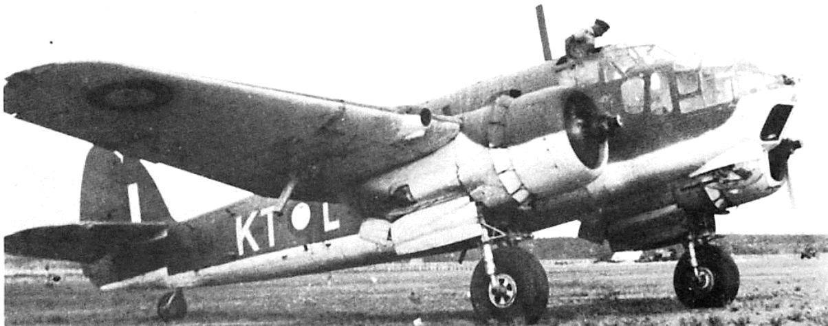
A9-124/KT-L. RAAF Foliage Green (K3/177) and RAAF Earth Brown (K3/178) disruptive camouflage over RAAF Sky Blue (K3/195), with Sky Blue code letters and RAAF Medium Sea Grey (K3/183) serial number. Standard (pre-Yagi) ASV aerial arrays – Search array on the aft fuselage and Homing array with one transmitting “whisker” on each side of the nose and one “dog-leg” receiving antenna below the cockpit.

On August 5 th , A9-124 was received by 12RSU for a 480-hourly. They, in turn, sent it to 13ARD (October 14 th ) for completion of the work and 13ARD released the machine to 10TU who received it on December 2 nd , 1943. 5OTU received -124 on January 2 nd , 1944 and on July 8 th , it was sent back to 10TU. 22